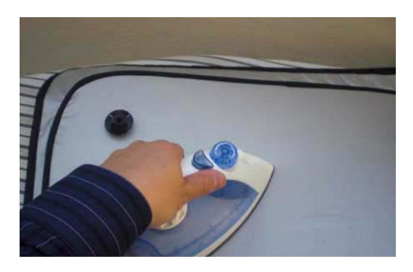
Step 3: Be sure to iron the loose fabric that surrounds the frame.