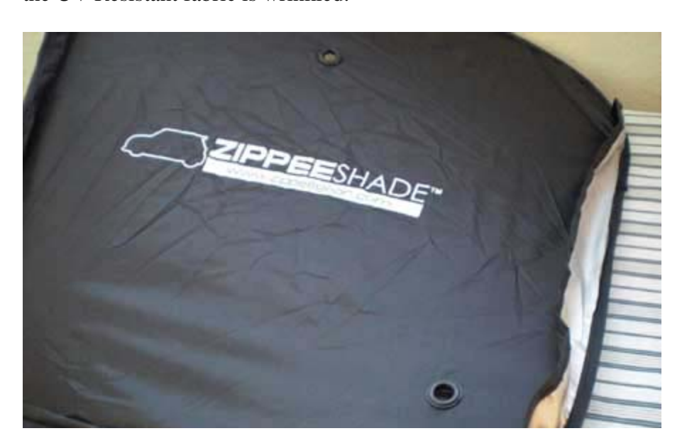
Step 1: Once you have removed your ZippeeShade from it's carrying case, you may notice that the UV Resistant fabric is wrinkled.

To prevent damage or loss of your ZippeeShade, we highly recommend that you remove the ZippeeShade from your Front Sunroof before you open it.