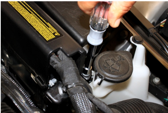
2. Undo 10mm Hex screw securing ECU cover.