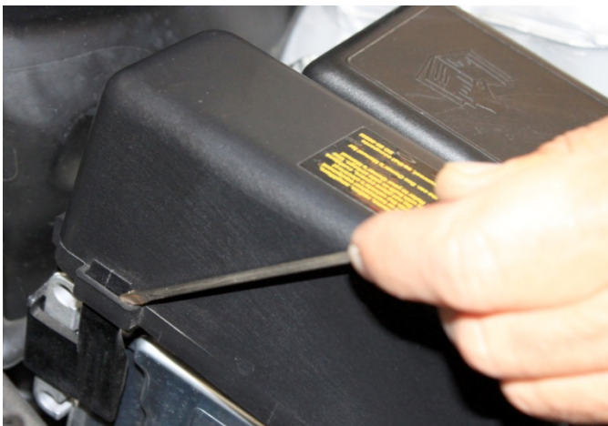
3. Use screwdriver to release the (4) locking tabs.