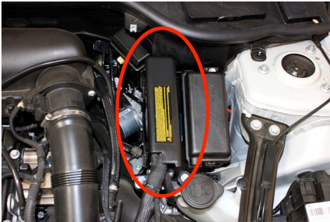
1. ECU location.

TOOLS REQUIRED: [1] Small Screwdriver [1] 10mm Nut Driver or Socket