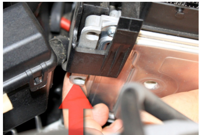
5. Just below the bottom of the ECU cast housing there is a plastic locking tab on each side. Push this tab toward the driver's side of vehicle and pull up ECU to unlock. Do same to other side. Now pull up ECU from mount.